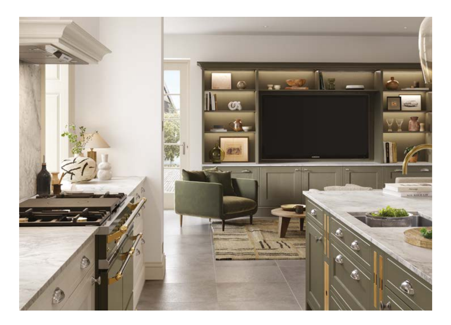
Endless design options to seamlessly integrate with other areas in the home 'Beyond the Kitchen'